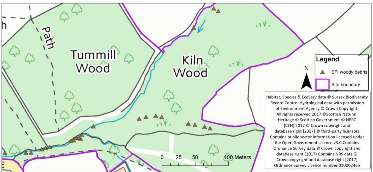
Figure 4. Map of Kiln Wood and Turnmill Wood showing locations of woody structures

The structures were installed on ordinary watercourses and ditches within Woodland Trust land, and therefore did not require consent from the Environment Agency, however East Sussex County Council were consulted.