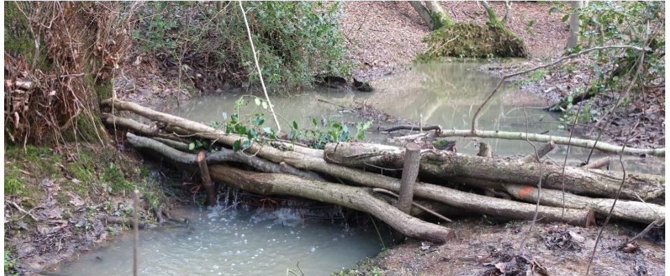
Figure 1. Leaky dam constructed to allow low flows to flow unimpeded, but to intercept, slow and divert flood waters

Woodlands can be ideal places to utilise natural woody material for Natural Flood Management (NFM). In this project a variety of woody material was strategically placed and secured in small headwater streams running through Kiln Wood and Turnmill Wood, Blackboys (East Sussex). These leaky dams slow and store water in the channel and in small floodplain areas during