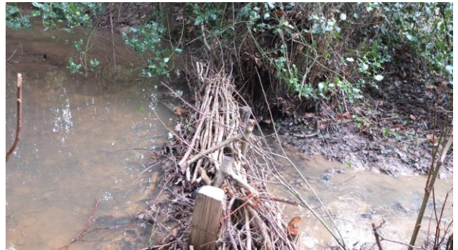
Figure 3. Leaky dam (top) and brash bundles intercepting overland flow pathway (bottom)