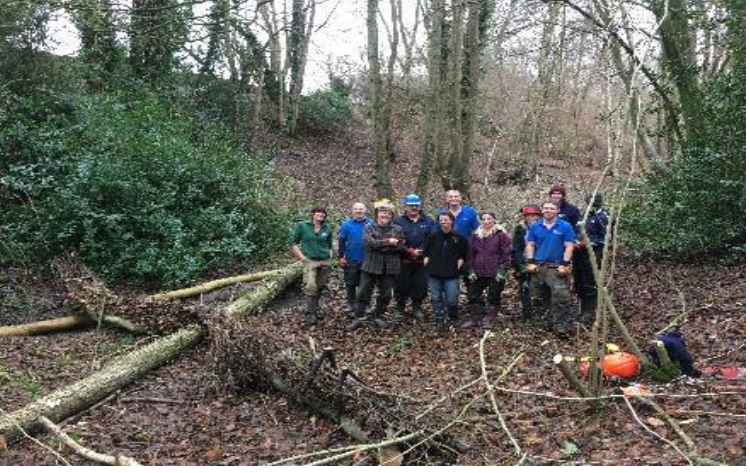
Figure 2. Volunteers installing leaky dams